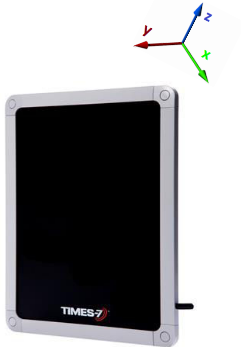
The SlimLine A6031